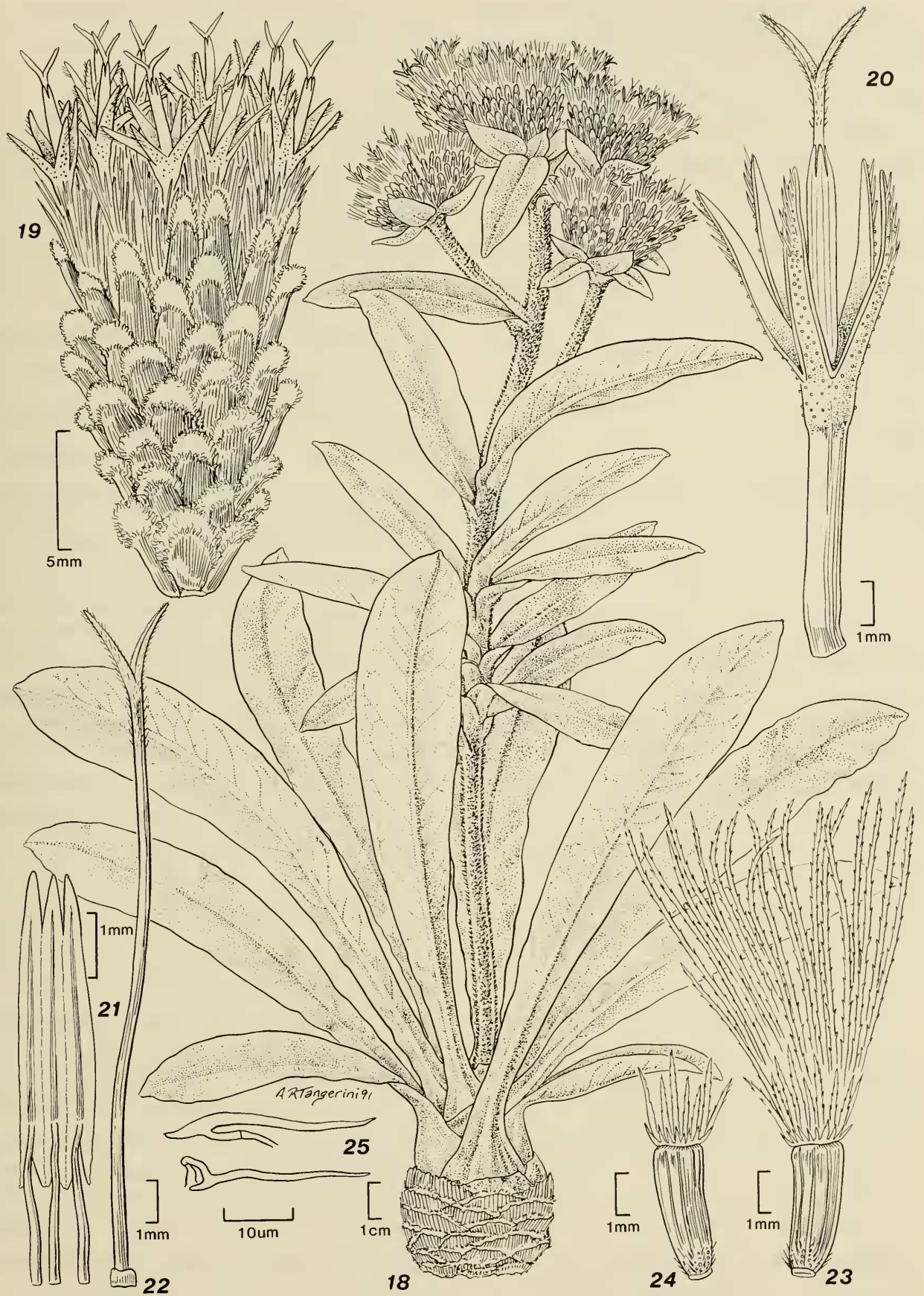
Figs. 18–25. Minasia alpestris (Gardner) H. Robinson; 18. Habit; 19. Head; 20. Corolla with anthers and style; 21. Anthers; 22. Style with nectary; 23. Achene with complete pappus; 24. Achene without inner pappus; 25. Trichomes from corolla lobe.